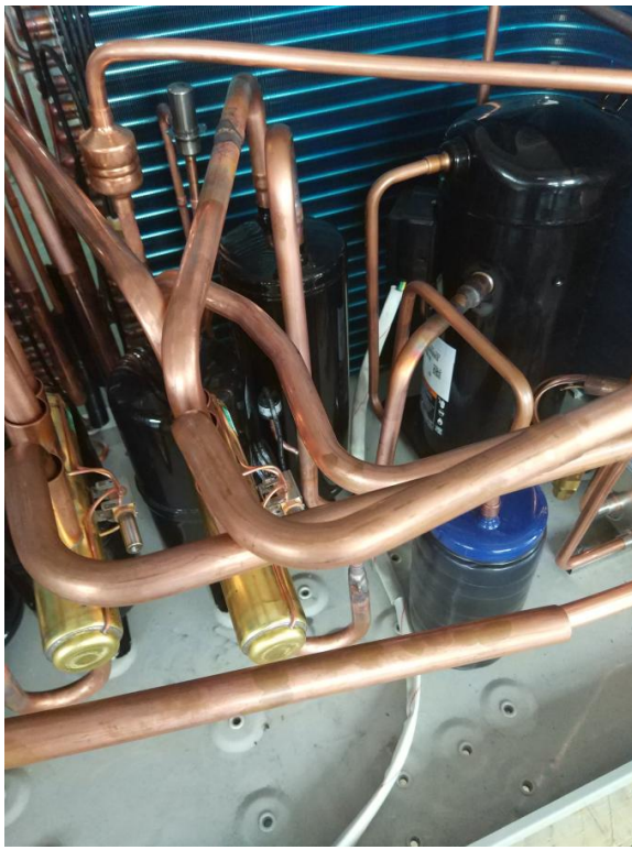
Housing Material: Stainless Steel or Galvanized Steel Sheet