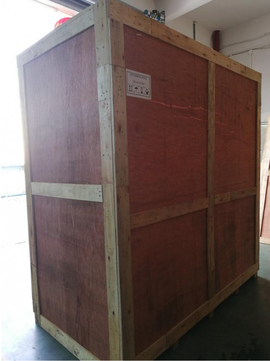
Swimming pool heat pump plywood case