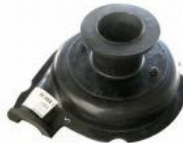
Cover Plate Liner